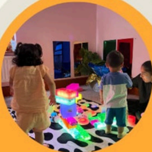
Sensory Class for Babies

At Sherwood Green Nursery We believe Sensory play focuses on activities that engage your babies senses, helping them develop language skills and motor skills.