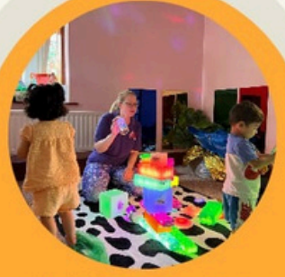
Building Babies Confidence