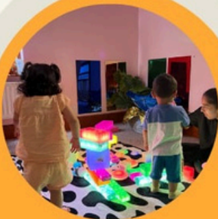
Sensory Class for Babies

At Sherwood Green Nursery We believe Sensory play focuses on activities that engage your babies senses, helping them develop language skills and motor skills.