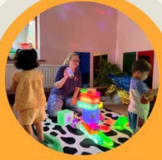
Building Babies Confidence