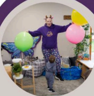
Sensory Class for Babies

At Sherwood Green Nursery Gateway We believe Sensory play focuses on activities that engage your babies senses, helping them develop language skills and motor skills. We would appreciate if a contribution of £5 per month could be made.