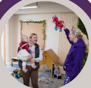
Building Babies Confidence

01274 752251 Sherwood Green Nursery Gateway