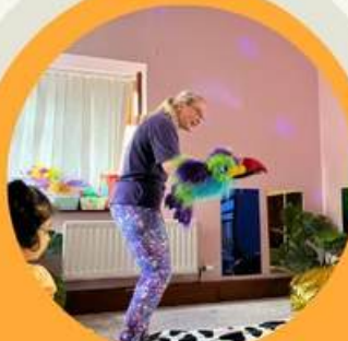
Fun and active for Babies