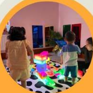
Sensory Class for Babies

At Sherwood Green Nursery We believe Sensory play focuses on activities that engage your babies senses, helping them develop language skills and motor skills.