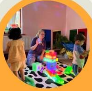
Building Babies Confidence